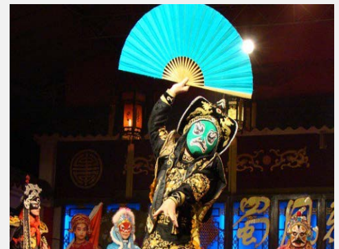
Image: Chinese Opera Chengdu Sichuan

"Spectacular Opera Across Borders" talk: Hong Kong Studies Initiatives (HKS) & Centre for Chinese Research (CCR)