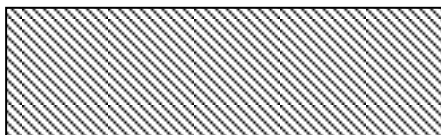
Figure 2.1 Sample caption for figure 1

Caption titles may be in title case (the first letters of all principal words are capitalized) or sentence case (only the first letter of the first word is capitalized). The case must be consistent throughout the entire thesis. The same rule applies to chapter and section titles.