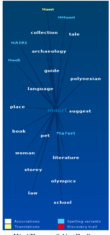
Māori Thesaurus Subject Headings