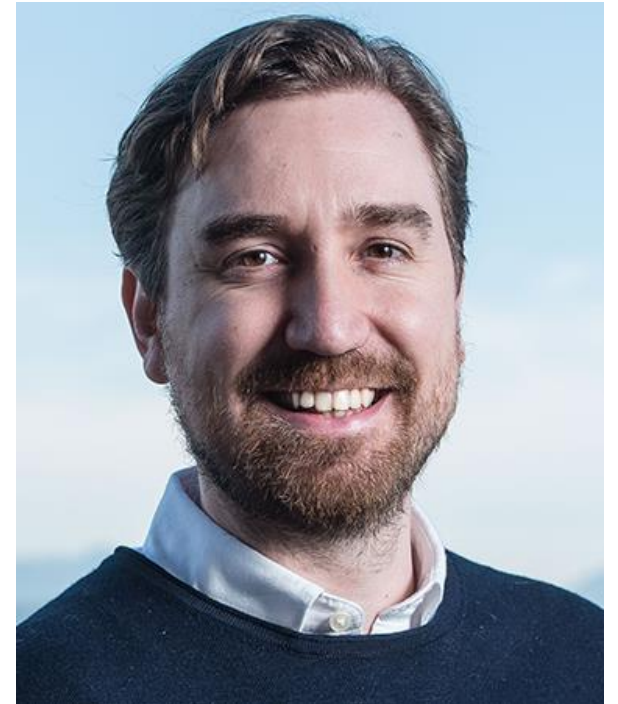
It's me, circa 2018