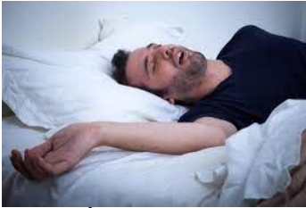
When Omicron 2.0 appears and you have to move to online sessions again