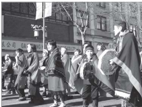
Chinese New Year, Aboriginal Participation Redwire Magazine, April 2005, p. i.

This was the first collaborative project between the Xwi7xwa library and Asian Library and we look forward to more partnerships, such as, The International Federation of Library Associations (IFLA) satellite conference Multicultural to Intercultural: Libraries Connecting Communities opening at the First Nations Longhouse August 5 th 2008!