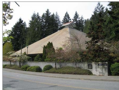
Asian Library, Asian Centre, 1871 West Mall Vancouver, B.C.