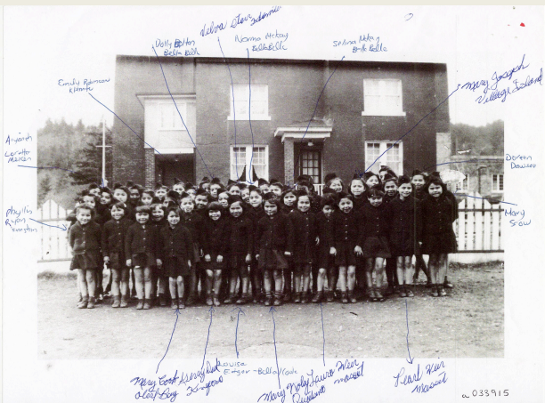
St. Michael's Residential School, Alert Bay, BC, Circa 1940

The Truth and Reconciliation Commission of Canada was established through the largest class action lawsuit in Canadian history. Its mandate is to gather records and testimony documenting the operation of the schools and to ensure that their cruelties are never forgotten and never repeated. The last of the TRC's major events on the west coast will be held here in Vancouver Sept 18-21.