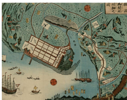
ONE OF THE MOST POPULAR IMAGES ON FLICKR, FAVOURITED OVER 3,000 TIMES