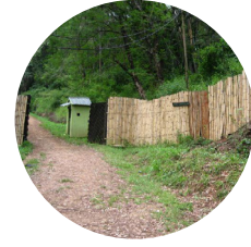
G- Karura Forest ($)