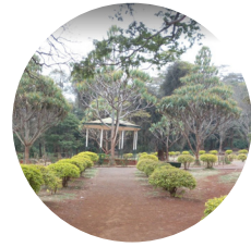
E- City Park ($)