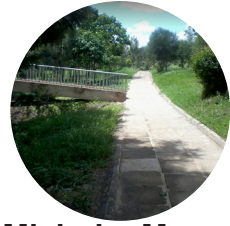
B- John Mishuku Memorial

WESTLANDS Great adjacency to open public spaces and integrated green spaces within the private properties