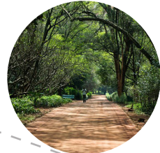
A- Nairobi Arboretum ($)

RUNDA ESTATES Elite Gated neighborhood with well managed streetscapes and lots of private open green spaces