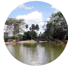
D- Uhuru Park