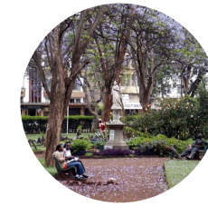
C- Jevanje Garden