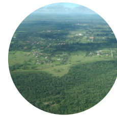
F- Ngong Forest Sanctuary ($)